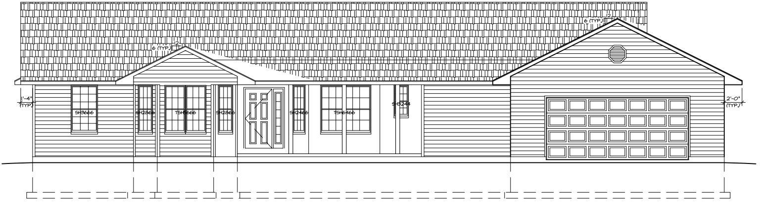
1 FRONT ELEVATION A-1